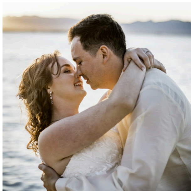
GOLDEN HOUR SHOOT, WEDDING DAY