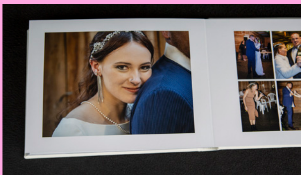
PHOTO ALBUM UPGRADE

Don't leave your precious photos on a hard drive where they're forgotten. A well-designed wedding photo album will become a treasured taonga to your family in the future.